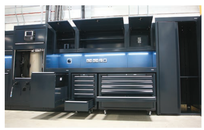
Workbays with fully integrated facilities

From the outset of the project, CCS consulted with the client and its appointed architect and contractors. Working with Dura's inhouse design team, BMW MINI Crewe's workshop was designed from the ground up to meet the growing dealership's operational needs and brand specification.