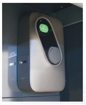
Integrated EV charging points

On site, the bespoke furniture was installed by CCS's experienced installation engineers, led by a dedicated project manager. Upon completion, CCS delivered team training to ensure the safe operation of new equipment prior to commission. Post-handover, CCS continued to support BMW MINI with ongoing servicing and maintenance, with Dura's quality guarantee keeping this important investment for Lookers BMW MINI Crewe working as good as it looks for years to come.