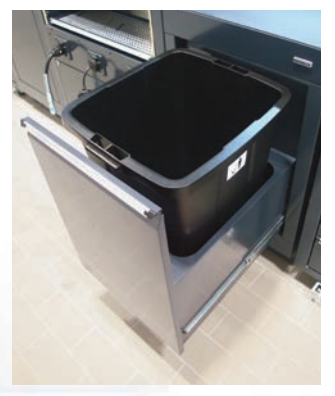
Workbays with waste management